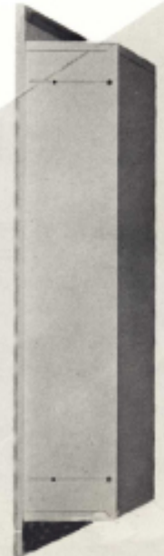
Back of cabinet without semi-recessing skirt.

Easy 4-screw adjustment for assembly to required depth.